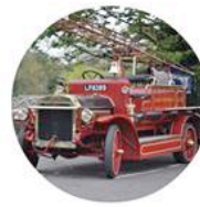
RCS Motor Club